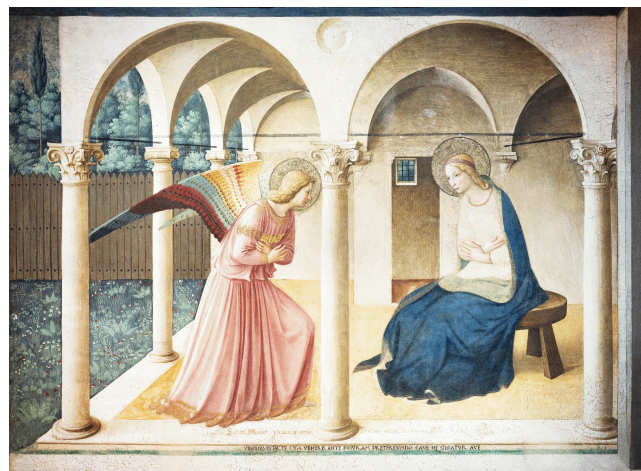
The Annunciation , by Fra Angelico (1438)