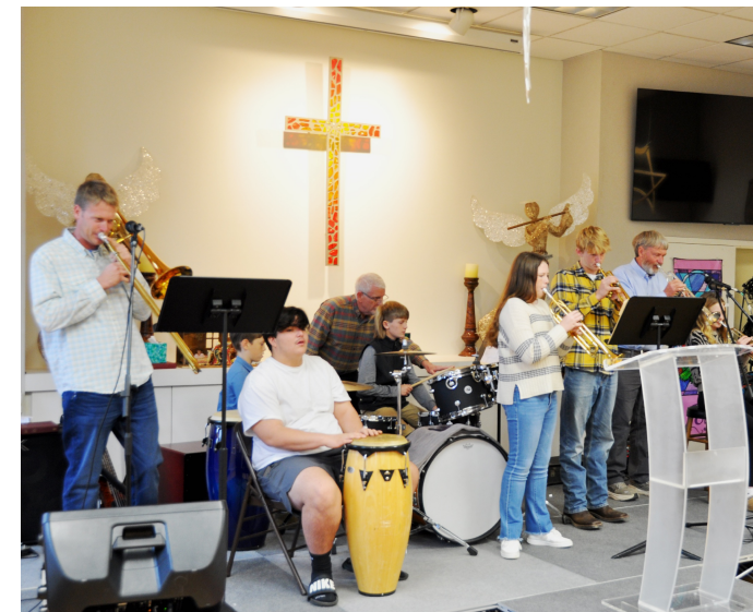
Rehearsal for the Christmas Pageant