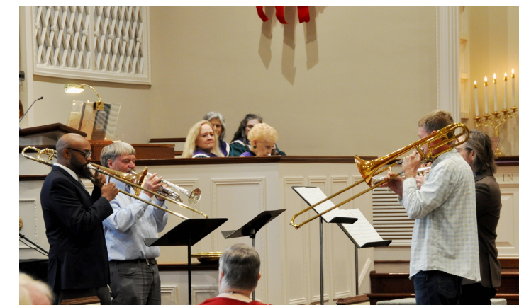
Brass Quartet at 11 AM Worship on November 30